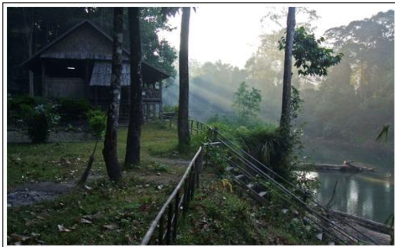
A riverside village huts (Khammouane, Laos)

Through us you and the local village people will talk, listen, ask and answer each other questions. That is a great experience. At the end of a day you will come back to stay in a safe and nice room surrounded by the nature.