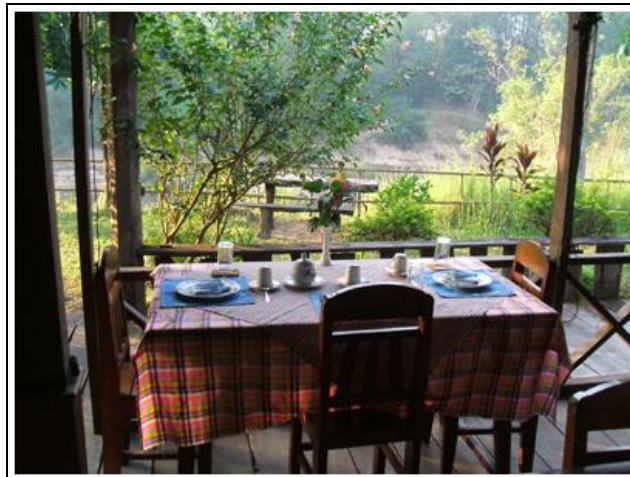
Accommodation on Hin Boun river (Khammouane, Laos)

In some places in Laos, you can go adventure without seeing any other tourists during the day and still come back to for a good dinner and comfortable village cottage