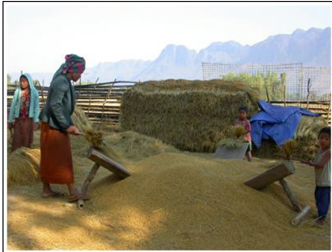
Remains of ruins of a lost civilization, village life (Khammouane, Laos)