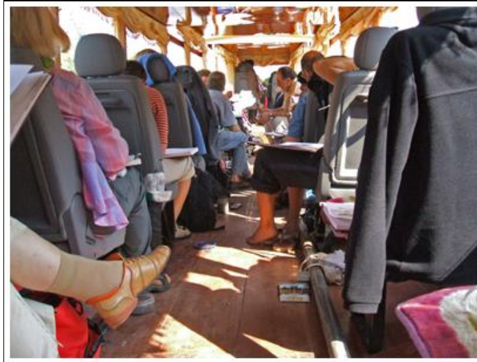
An artist group on a private slow boat on Mekong river (northern Laos)

Arts and graphic painting groups are one of our regular trips. Every trip is different from the previous one. Local museums, archaeological sites, minority people places, geographically interesting places are also ones of our old friends/clients favorites. We take time to discuss, research, find out and design the good travel plan.