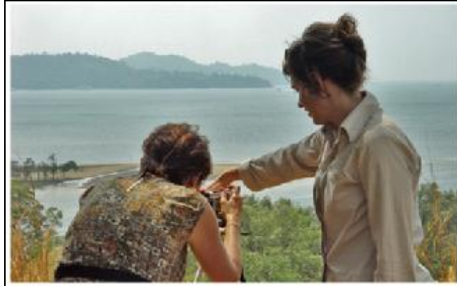
Photography, sea beach, mangroves --- (Ranong)

Special interest trips and soft adventures with relaxation and comfort