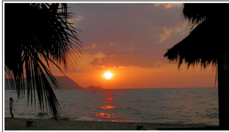
Sea beach (Satahip)