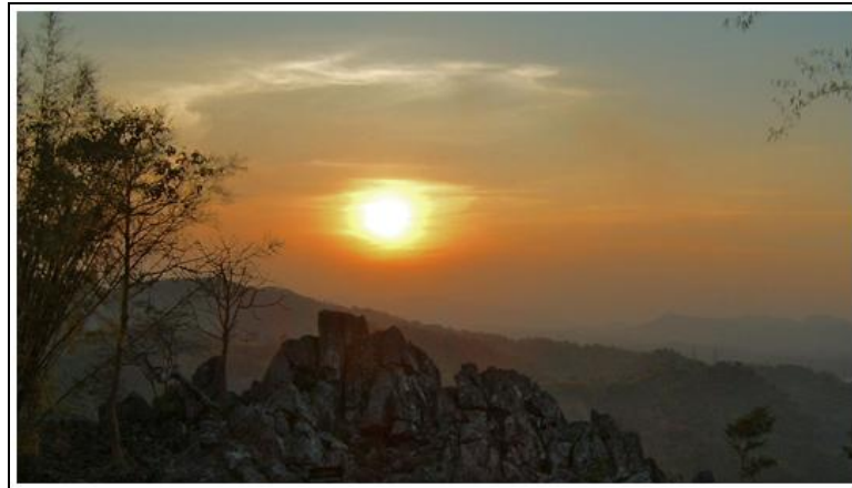
Sunset (Loei, Phetchabun)

We can also recommend visit to local traditional festivals such as boat racing depending on time and place. Of course during these times the festive place is usually crowded. However we could usually find a good quiet place a bit away from the festival.