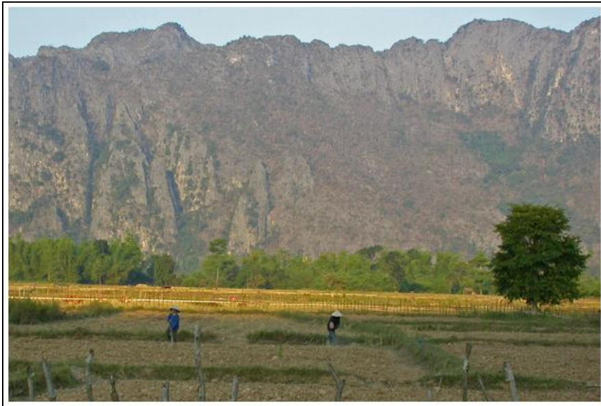
Paddy farmers with limestone cliff in the back ground (Hin Boun river valley, Laos)

Wherever we go the local people are our resources and our guides. They give us additional useful details to add to our books, maps and photo knowledge. They are in fact important part of our trip management. They provide value and insight knowledge. You will also be the ones to communicate with them.