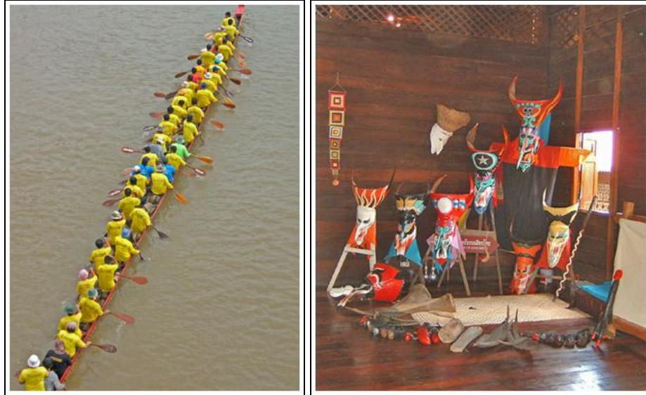
Boat racing (Nan), Phi Tha Khong Festival (Loei)

We can also recommend visit to local traditional festivals such as boat racing depending on time and place. Of course during these times the festive place is usually crowded. However we could usually find a good quiet place a bit away from the festival.