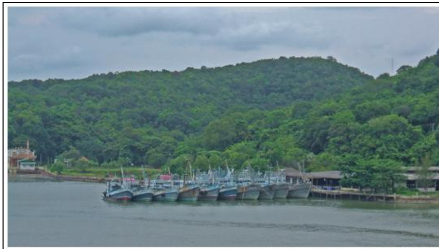
Fishing boats at river mouth (Chanthaburi)

Our management also includes recommendation of what you should bring and to what amount, what you should not bring, the local traditions, dos and don'ts.