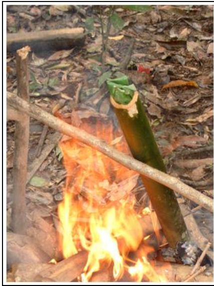
Boiling stream water inside a bamboo (Sangklaburi)