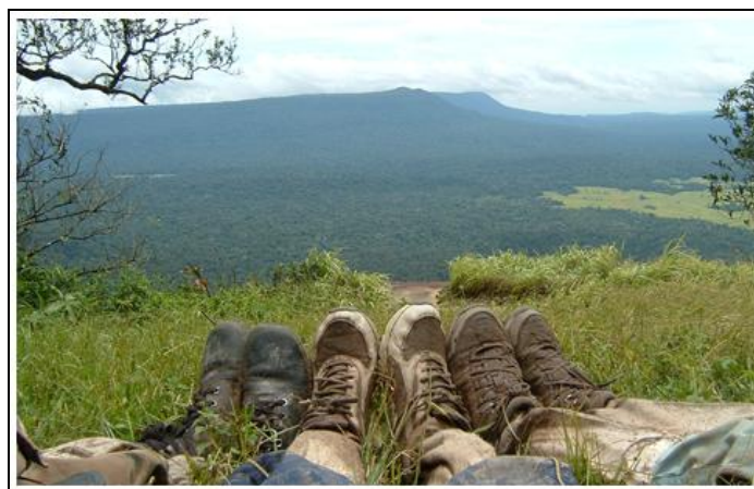
Accomplishment, self improvement and confidence plus friendship (Khao Laem mountain top in Khao Yai national park)