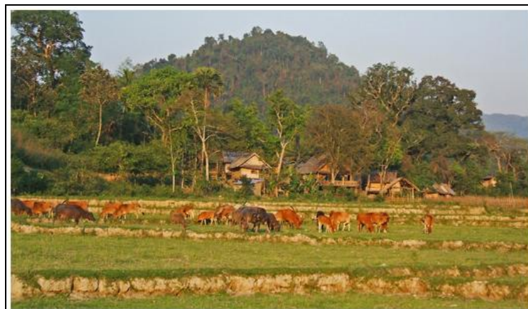
A village scene in northern Laos