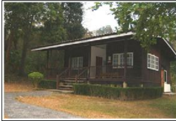
A bungalow accommodation in a Thailand national park (Khao Luang in Sukhothai)

In our nature-included trips variety of accommodations are possible depending on what are available where/when we go.