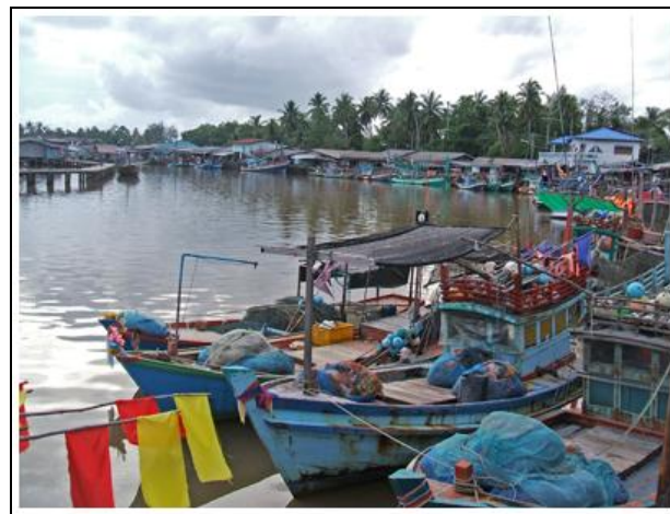
Seaside fishing village, mangroves (Trat)