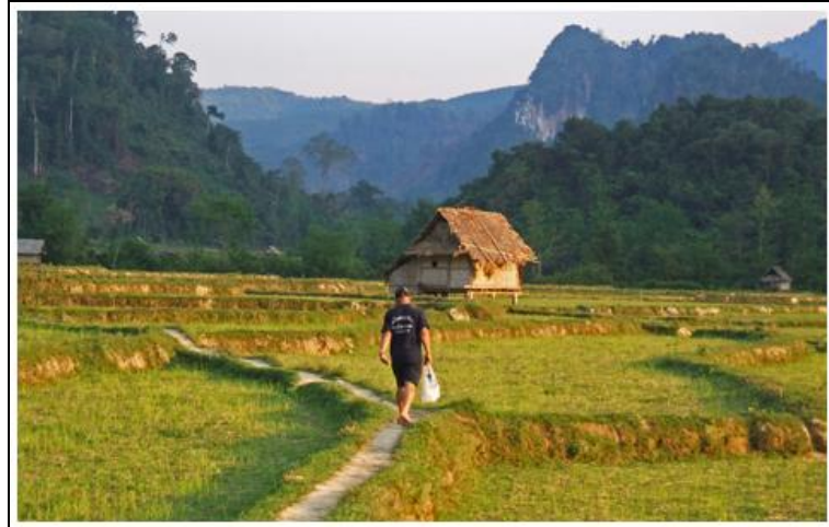
A survey trip in northern Laos