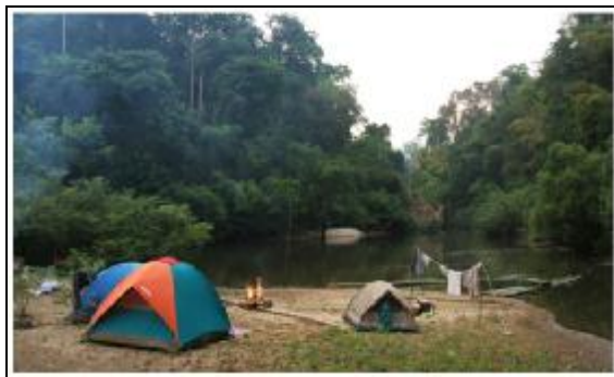
Hill tribe village cottage hut or home stay | Jungle camping in tents (Umphang)