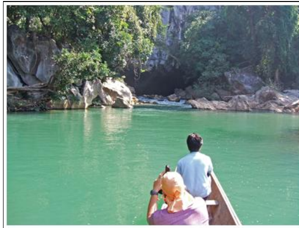
Entering 7.5 km long Konglor cave (Khammouane province, Laos)