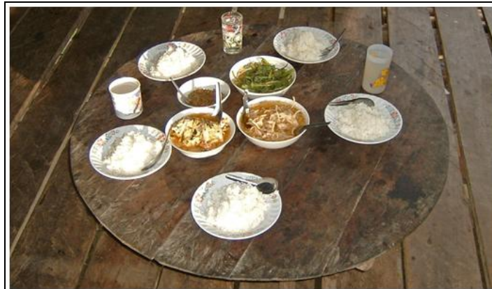
Very basic and simple dinner in a tribal village home (Sangklaburi)