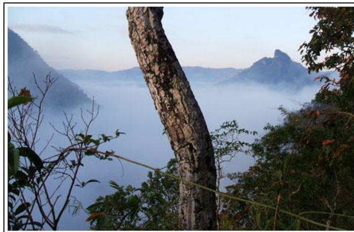
In one of our later surveys we were there

Some of our great assets are our close friendship with the local people, hard working members of Trek Thailand team comprising of several different cultures and native languages, understanding and care offered one upon other among us, and our desire to explore with care in environmentally and culturally friendly ways.