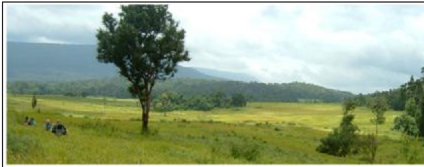
Khao Laem grassland (Khao Yai National Park)

Relaxed, soft and hard adventure travel management in Thailand and Laos