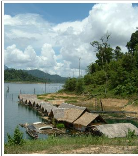
Very basic bamboo floating (raft) huts on the waters (Cheow Lan lake, Khao Sok national park)

What are there for you in our trips, and what you will gain? Again possibilities are better described by diversity and breadth. From relaxation, comfort, quietness, great scenery to adventure and survival, learning, multi cultural experience; there are almost endless opportunities to soak up and discover.