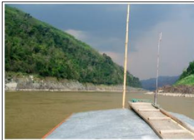
It is a great moment when you enjoy the quality time while you are surrounded by such a world like this. Private slow boat trip on the Mekong river in northern Laos.

What are there for you in our trips, and what you will gain? Again possibilities are better described by diversity and breadth. From relaxation, comfort, quietness, great scenery to adventure and survival, learning, multi cultural experience; there are almost endless opportunities to soak up and discover.