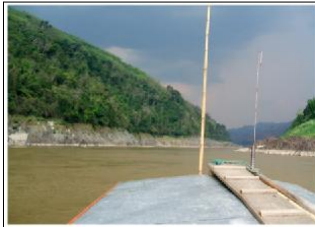
It is a great moment when you enjoy the quality time while you are surrounded by such a world like this. Private slow boat trip on the Mekong river in northern Laos.

What are there for you in our trips, and what you will gain? Again possibilities are better described by diversity and breadth. From relaxation, comfort, quietness, great scenery to adventure and survival, learning, multi cultural experience; there are almost endless opportunities to soak up and discover.