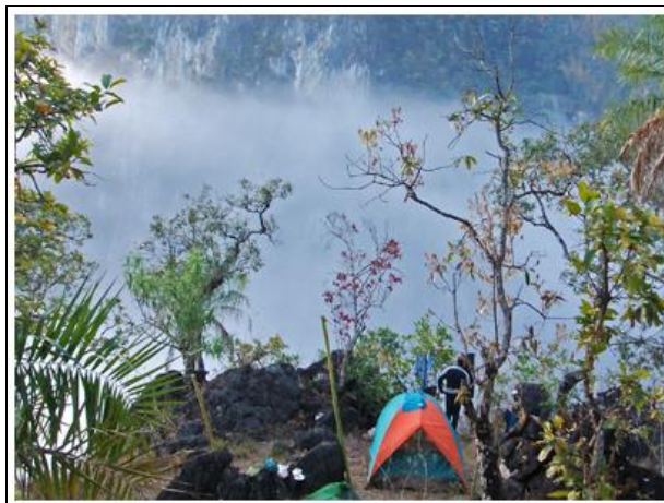
Jungle camping at a place where there is no natural water source

Depending on where we go, when, what are available, and how we would like stay we plan the accommodations. It could be a nice and comfortable lodge in beautiful and culturally rich place. It could just be a rustic and basic bamboo hut with toilet and shower outside in a remote village. In a multi-day jungle expedition it would be camping in the middle of thick rain forest.