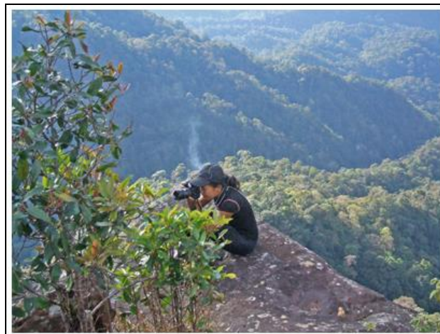
Mountain climbing, nature photography (Klong Tron national park)