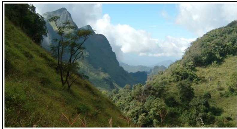
A highland scene of northern Thailand