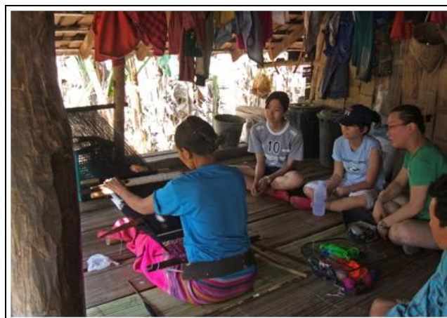
At a Karen village in Umphang. There are so many things about the simple ways of life of these minority tribal peoples. It is like peoples of two very different worlds meet and talk to each other.